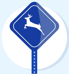
Striking, or being struck by, an animal