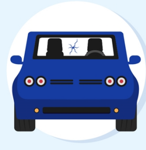
Damage to the windshield or any glass

This type of insurance typically does not include coverage for costs associated with: