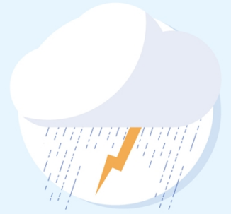
Inclement weather or natural disasters