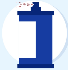
Riots or vandalism